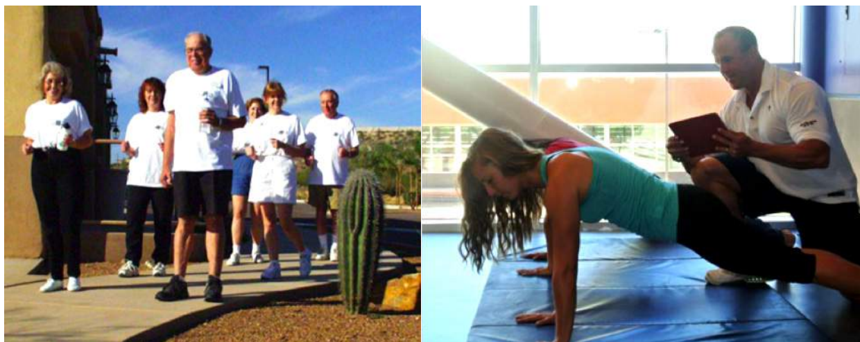
Figure 5. Regular physical activity is a step towards preventing many diseases

Some women using menopausal hormone therapy to relieve hot flashes and other menopausal symptoms may increase their risk of developing breast cancer. The risk declines over time once a woman stops taking the menopausal hormone