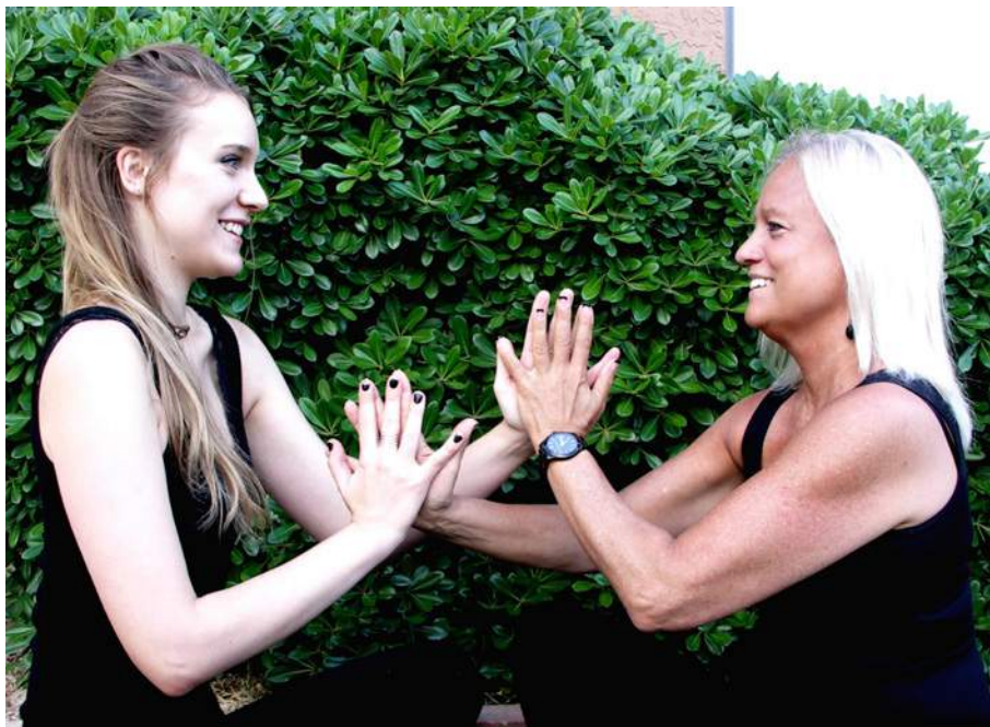
Figure 1. Regular fun physical activity, like yoga, can help prevent breast cancer