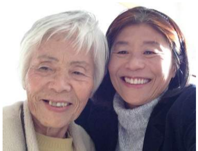
Figure 3. Family history plays a role in the risk of breast cancer

Innate risk factors include gender, age, family history, and genetics. Women are much more likely to get breast cancer than men, and the risk of cancer increases with age. Most breast cancers and breast cancer deaths occur in women aged 50 and older. 3 Family history and genetics also play a large role in the risk of breast cancer. Risk increases in individuals with a first-degree family member (example: mother and daughter, or sisters) that has also been diagnosed with breast cancer. Research has shown that certain genes can mutate (change in DNA, the hereditary materials of life) to cause breast cancer. Women who have family members with breast cancer may consider genetic testing to detect certain genes mutations. 4 Talk to your physician about assessing your risk of breast cancer and the importance of monitoring your breast health throughout life.